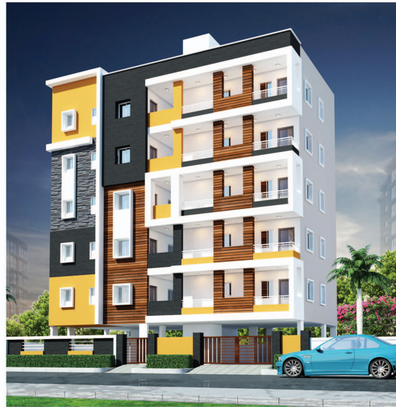
Plot No. 538 & 539 - 1105 sft & 1135 sft