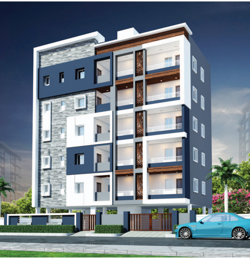
Plot No. 63 & 64 - 1105 sft & 1135 sft